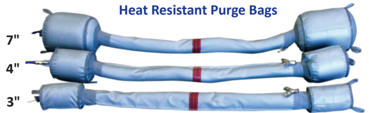
e.g. 7" Pipe will purge in less than 4 minutes!

The welder can position these systems prior to pre-heating and leave them in place throughout the pre-heating, welding and post-heat treatment cycles, allowing the weld to be purged continuously for up to 24 hours if necessary.