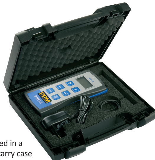
Supplied in a durable carry case